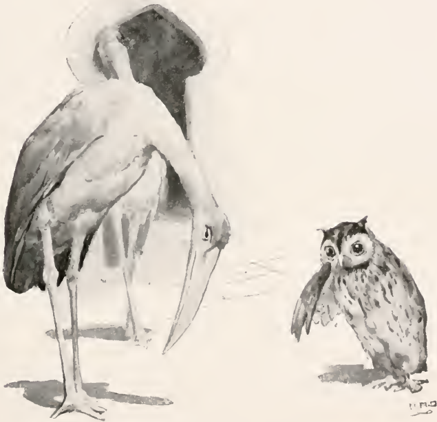
He bowed his long neck. (P. 20.)

the door open with his beak and stood astounded upon the threshold. In a ruined chamber, lighted only by the rays of the moon, which streamed through a little casement window, he saw a large owl. Tears streamed from her great brown eyes, and with hoarse